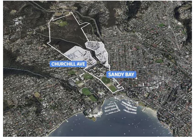
Liberal Government secret deal with UTAS means the land shaded in grey will be approved for sale.

Instead the community and parliament have been hoodwinked. No business case has been disclosed and the government negotiated in secret with UTAS. The bill instead rezones and approves for sale substantial campus land including important STEM facilities.