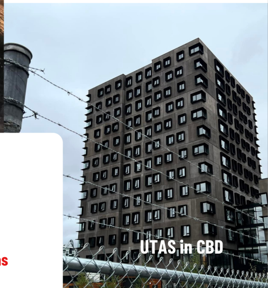
UTAS in CBD