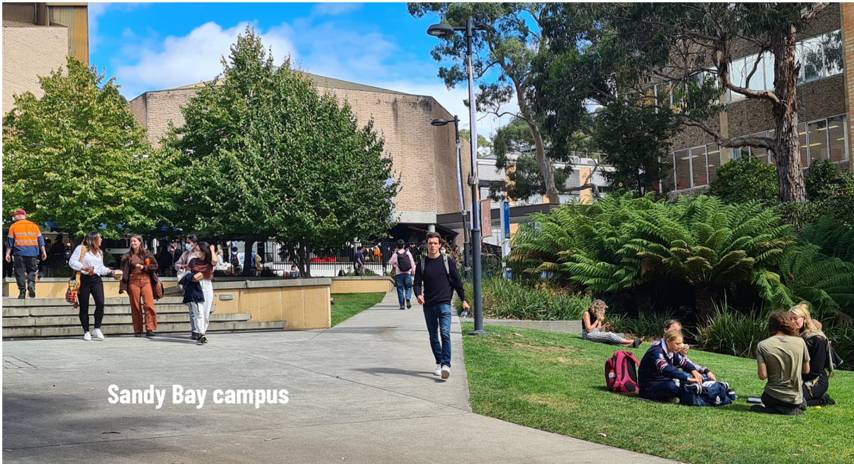
Sandy Bay campus