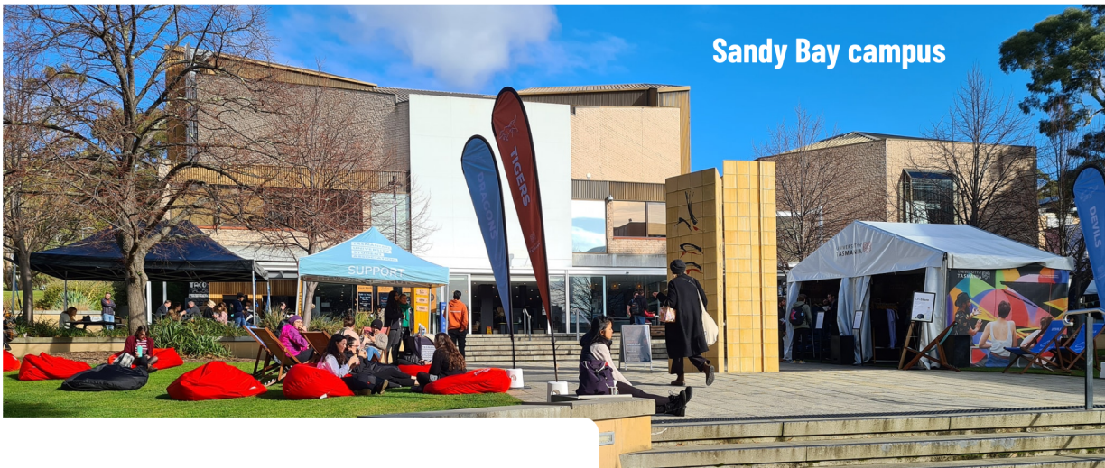
Sandy Bay campus

"Loss of student amenities, inadequate spaces and a lifeless atmosphere. Why are we giving up a green campus for this?"